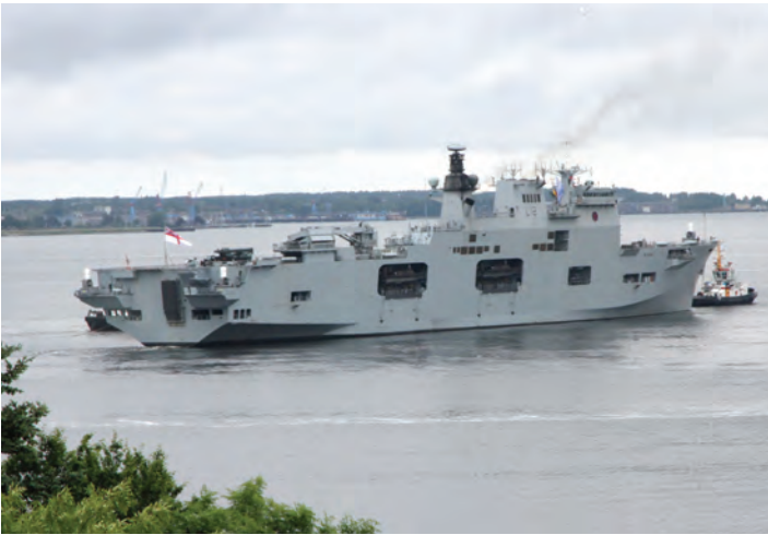
HMS Ocean, a Royal Navy amphibious assault ship, seen from the conference venue.