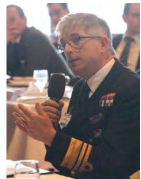
Conceptualizing maritime security is much more complex than in the past.