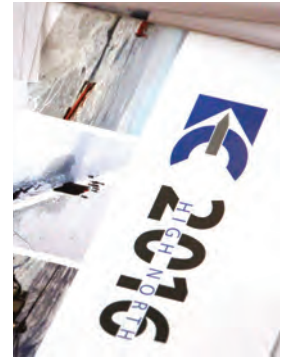
A unique and carefully orchestrated programme awaits the participants.

"We all recognize that they [the Russians] are more active than we feel comfortable. With a behavior set that makes us feel uncomfortable and a presence around our shores and a presence around our hardware and our warships that is distinctly too close."