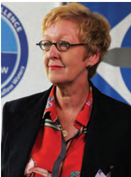
Providing a perspective from NATO HQ and Brussels.

assumes to be Russian. The Russian Federation justifies its current drive to expand its territory with the extended continental shelf considered to be part of the country's landmass. In fact, over 100 countries are presently employing a similar line of argumentation in order to expand their territorial waters by interpreting UNCLOS in their favour. However, current Russian behaviour may suggest it will not accept any foreign ruling on its extended continental shelf. Domestic politics and the inward projection of a powerful world power may be a driving factor, since the planting of a Russian flag at the North Pole's seabed appears to have been primarily aimed at the domestic audience. The expectation that Russia may not adhere to the provisions of UNCLOS are fuelled by the demand of prior notification from Chinese ice breaker voyages in what is assumed to be own territorial waters. While the Russian delineation of its territorial waters is based on the argument of the extended continental shelf, there is also no legal basis for the prohibition of innocent passage of civilian vessels. Due to the fundamental relevance of Freedom of Navigation for the global economy, efforts to safeguard this principle should not be neglected in order to prevent the establishments