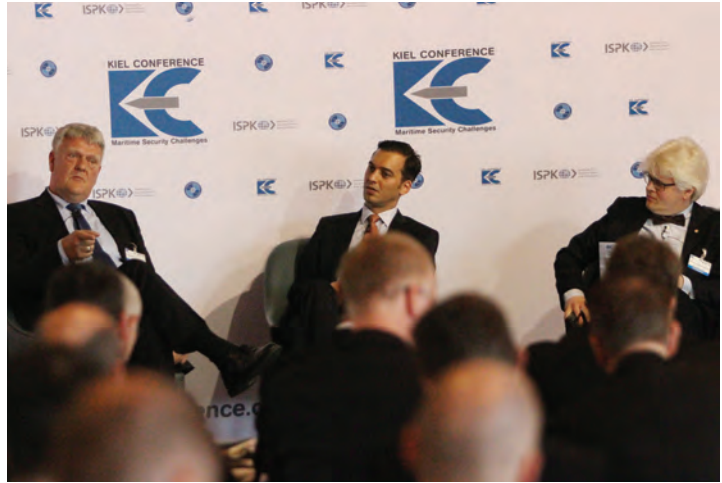
Arctic shipping and resource exploitation remain a sketchy possibility at best.

porations need to act quickly and find ways to become a significant stakeholder in the Arctic and, thus, prevent the establishment of Chinese economic dominance just off the Russian shores. Another complicating factor is the lack of unity and coordination among the Western powers, since interests are not even aligned within NATO as a whole. For example, the U.S. is considering the Northwest Passage as international waters, thereby challenging the Canadian claim that these waters are Canadian territorial waters. Accordingly, NATO may serve as a vehicle of communication and exchange between its Arctic members, yet not in order to create concerted action in the region. The European Union has also been reluctant to fulfil that role, which is not entirely surprising, since most of its members are non-Arctic states. Besides these dynamics emanating from the Arctic itself, its future trajectory is still largely contingent on a variety of external effects. These are primarily the variables of global warming and globalisation which have a decisive impact on the costs and potential profits of operating in the extreme conditions of the High North. It appears safe to assume that these two mechanisms define the extent to which human economic activity can and will ex-