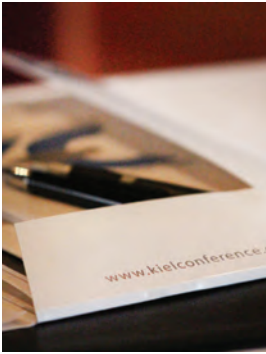
Undivided attention for the keynote speech.