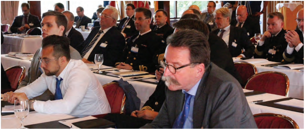
The Kiel Conference brings together distinguished experts and international maritime professionals.

"We do have arrangements in place that we have signed with the Russians some time ago, but I think it is important to not only recollect them but also actually remind our Russian counterparts as well as our own colleagues [...] that we will need to live up with them."