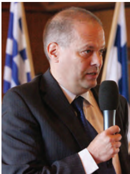
A polish academic during the Q&A session

The People's Liberation Army Navy (PLAN) is undergoing a remarkable modernisation of its assets. Next to the PRC's increasing dependence on maritime trade, this modernisation is fuelled by Chinese threat perceptions of being virtually surrounded on three sides by the United States and their allies in the Asia-Pacific Region. This encirclement is perceived to be ranging from Japan in the East to India in the South and South-West, forming a C-shape. The modernisation's most visible success is the operation of the Liaoning, the first Chinese aircraft carrier using a hull acquired from Ukraine. However, the PLAN's current main role appears to be the strengthening of the Asian-Pacific core, as opposed to ambitions of global power projection. So far, China rather appears to intend the employment of its aircraft carrier as an asset to coercive diplomacy towards its neighbours than as an asset for high-intensity warfare. Next to supporting regional dominance, the PLAN seems to acknowledge the importance of a forward defence strategy/capability since