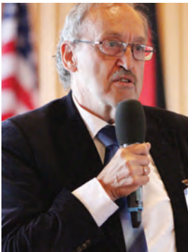
An intervention from the audience

The commercial drive into the Arctic region has been stalled by the Western sanctions against Russia, implemented as a reaction to the annexation of Crimea. Western corporations' ability to invest in Arctic development has since decreased. Another factor slowing down investments in the Arctic are low oil prices which make Arctic exploration and exploitation a risky and expensive endeavour due to diminished or no returns. Compensating for the lack of Western engagement, Russia is seeking investments and expertise from China in order to benefit from the region's resources. Hence, Western sanctions may turn out to have the unintended consequence of shutting out Western corporations from the Arctic region to the benefit of the Chinese. While there is no identifiable timeline, it may be argued that Western governments and cor-