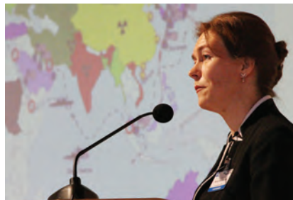
A well-rounded perspective on China for the panel.

reach and their indispensability for the long-term prospects of the Russian economy. As a result of current Western sanctions, Russia depends heavily on Chinese investment in the region's infrastructure and the exploitation of its coveted mineral wealth. While enhanced cooperation seems to mirror the Chinese dependence on top-tier naval technology, the relationship between the two countries vis-à-vis the Arctic is not as cooperative and shaped by interdependence as it might appear at first glance. While Moscow desperately needs Chinese investment along its Northern shoreline, the activities of Beijing's research and commercial assets are also a source of concern. This is caused mainly by the lack of surveillance capability. Russian leaders appear to view themselves vulnerable to commando raids or other covert operations emanating from ostensibly peaceful Chinese vessels in the area. If one accepts this notion, it follows that the Russian threat perception to-